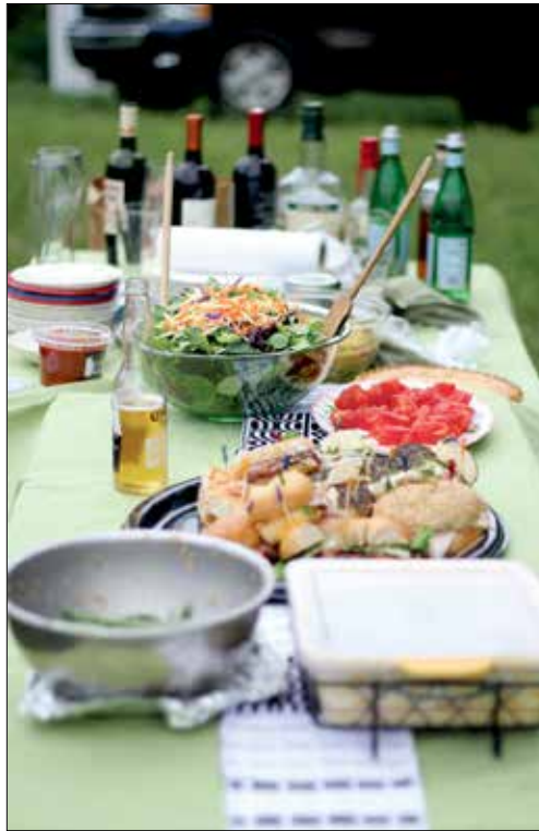
A platter of bagel sandwiches from L’Chayim Delicatessen at an end-of-summer party.

Quickly, the Loveless send-off party was re-purposed to also be a fundraiser for L’Chayim. The Facebook posts and emails